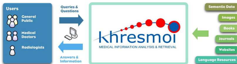
Figure 1. Overview of the proposed KHRESMOI system

restricted information exists – the Cochrane Collaboration has for example granted KHRESMOI access to its reviews. Use will also be made of existing semantic data, such as the Linked Life Data, and available language resources for the multi-lingual component.